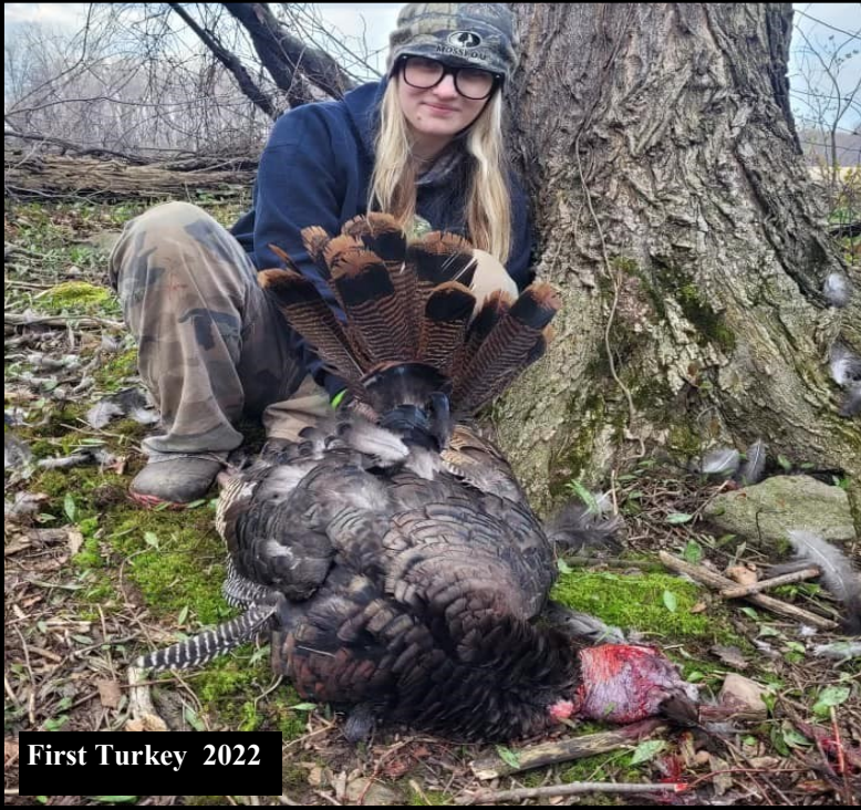
First Turkey 2022