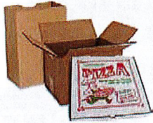
Cardboard & Pizza Boxes Flatten cardboard. Remove wax paper from pizza boxes