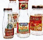
Clear Bottles & Jars