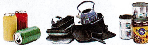
Aluminum Cans, Metal Cookware, Steel & Tin Cans