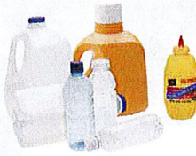
Jugs & Bottles with Small Top Openings