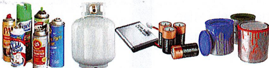
Aerosol Cans, Propane Tanks, Batteries & Paint Cans