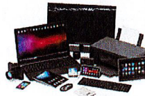
Electronics, Cords & Christmas Lights