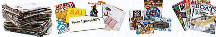
Newspaper, Office Paper, Paper Bags, Junk Mail, Paperboard & Magazines

Paper Place loose in cart. Use clear plastic bags for shredded paper ONLY .