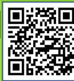
Tournament QR Code

Use your SmartPhone to scan the QR Code. Then register to play in any of the events using the Scoreholio App