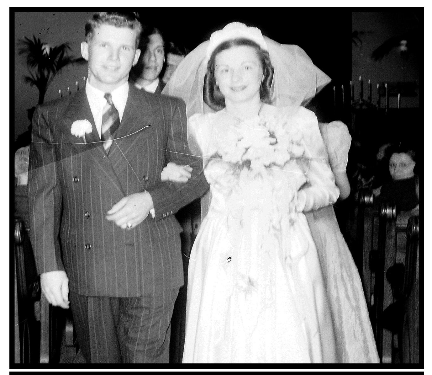
Anyone have a guess of who this couple might be? Thinking it is a Clarendon church wedding from the 40's or 50's ????????