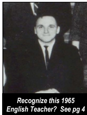
Recognize this 1965 English Teacher? See pg 4

will be available from August 1st thru close of business on October 1, 2018. Remember to send digital photos of your hunting and fishing successes to tctc@rochester.rr.com for display in the Clerk's Office!