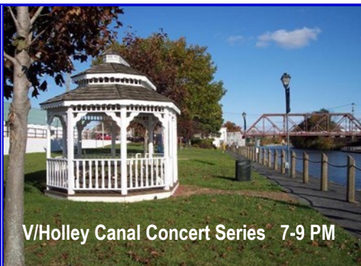
V/Holley Canal Concert Series 7-9 PM

For membership eligibility go to AL529holleyny.org.