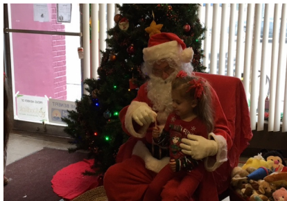
Community Center Christmas Party 12/16/17