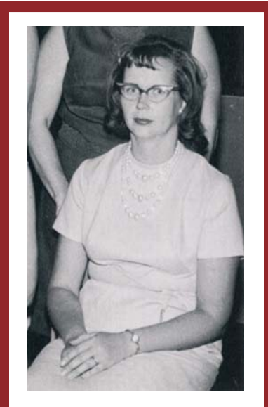
Do you recognize this St. Mary's Women's Club member? Photo 1966.