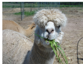
Palatium, Stoney Meadows stud male