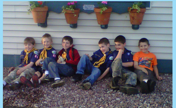
Clarendon Cub Scouts helped beautify the Community this year by planting the flower pots at the Town Hall. Thanks guys ~ they look wonderful !