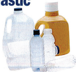
Plastic Jugs/Bottles* Empty containers only ♻️ ♻️