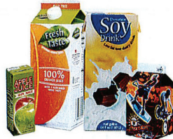
Milk & Juice Cartons Empty containers only