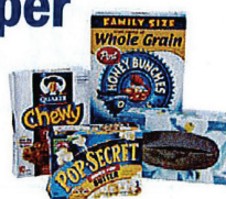
Paperboard No wax coated paperboard