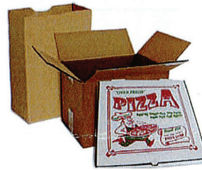
Cardboard, Pizza Boxes & Paper Bags Flatten cardboard & cut into pieces. Remove wax paper from pizza boxes