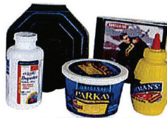
Household Plastic* Empty containers only ♻️ ♻️ ♻️ ♻️ ♻️ ♻️