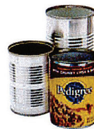
Steel & Tin Cans* Empty cans only