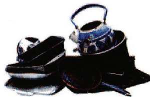
Kitchen Cookware Metal pots, pans, tins & utensils