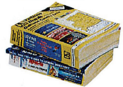
Phone Books All types & sizes