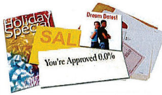
Office Paper & Junk Mail Envelopes, Flyers, Brochures, Postcards, etc.