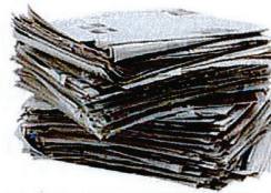
Newspaper Remove bags, strings & rubber bands