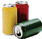
Aluminum Cans* Empty cans only