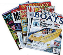
Magazines & Catalogs All types & sizes