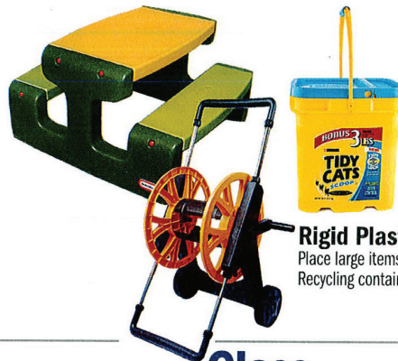
Rigid Plastic* Place large items next to Recycling containers