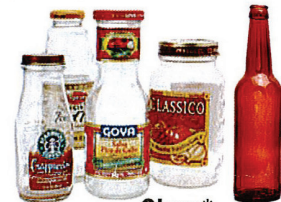
Glass* Clear & colored