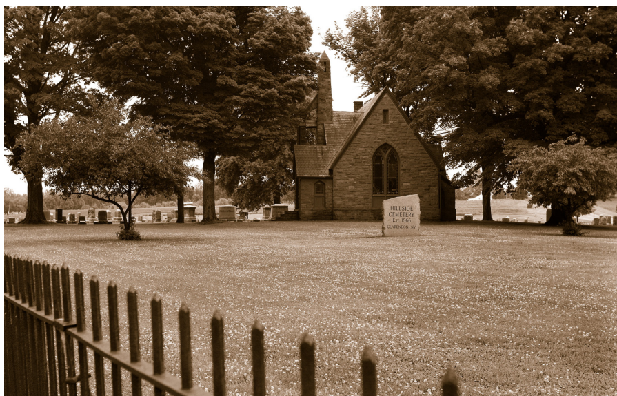
The HILLSIDE CEMETERY , the largest and only active cemetery in Clarendon today, was in 1833, started on the west side of Holley Byron Road, south of Nelson Street, known as the Presbyterian Cemetery. It was moved to its present location when the Holley Cemetery Association organized in 1866 with an election of trustees to procure, develop and maintain lands exclusively for burial of the dead from the Village of Holley and vicinity. The Gothic Style rock-faced Medina Sandstone Chapel built in 1894 remains on the cemetery grounds today. The Holley Cemetery Association maintained Hillside until it disbanded and pursuant to New York State law, ownership reverted to the Town of Clarendon in 2004. Each year, the local VFW and American Legion decorate Veteran graves in all the Clarendon Cemeteries with our Nation's Flag.

Due to the holidays and time constraints with the printers, the Town Board Minutes for December will be included in the February Issue. Sorry for any inconvenience.