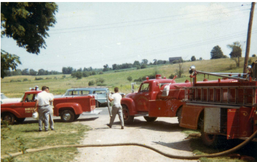
Circa 1965 Sommerfeldt Barn Fire Rte 237, Clarendon

Town Clerk's Office will be closed April 29 thru May 1 for State Conference