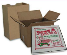
Cardboard & Paper Bags Flatten cardboard & cut into pieces