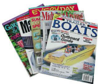
Magazines & Catalogs All types and sizes