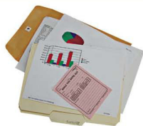
Office Paper All types and sizes