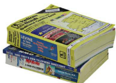
Phone books All types and sizes