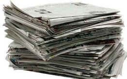
Newspaper Remove bags, strings and rubber bands