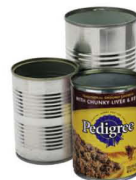
* Steel & Tin Cans Empty cans only