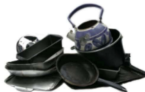
Kitchen Cookware Metal pots, pans, tins & utensils