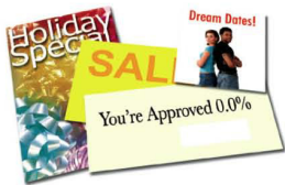
Junk Mail Envelopes, Flyers, Brochures, Postcards etc.