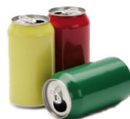
* Aluminum Cans Empty cans only