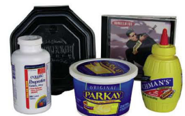
* Household Plastic (#3 - #7) Empty containers only