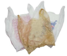
* Plastic Bags Most retail and grocery bags