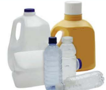
* Plastic Jugs/Bottles (#1 & #2)