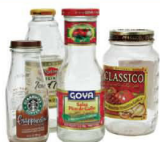
Glass Clear and colored