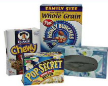
Paperboard No wax coated paperboard